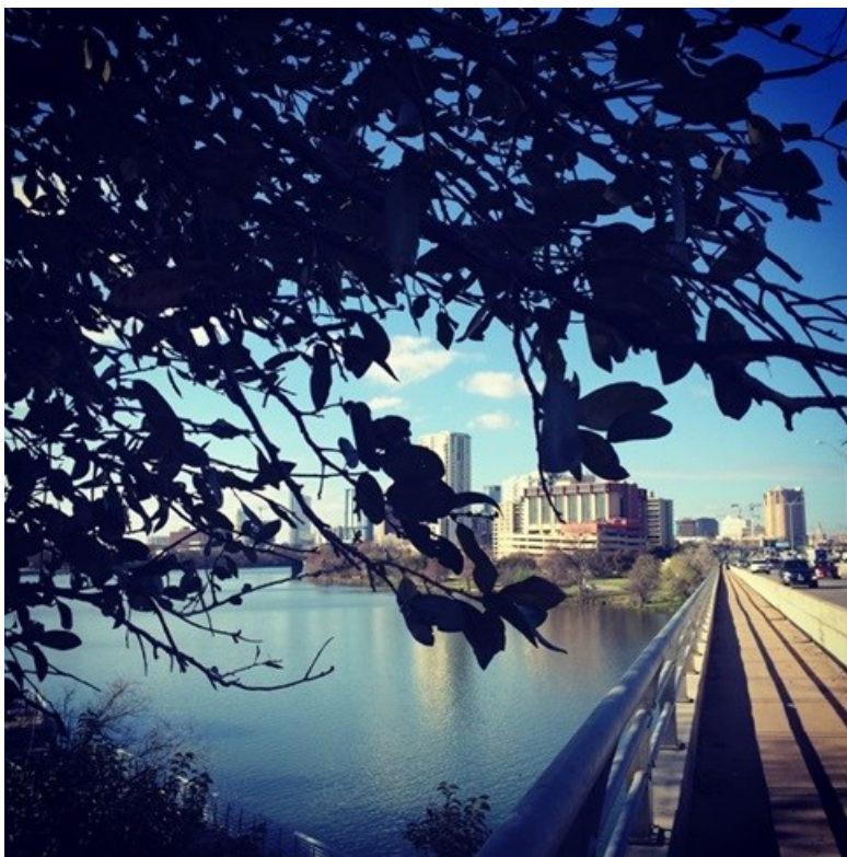
Austin, Texas on the mighty Colorado River.

I'm not a newbie to conferences; I've been to and spoken at more than I can remember. I love to learn , and as a marketer whose world is becoming more and more digital each day, I figured (and was convinced by previous shiny-eyed SXSW-ers) that this was the shizz. Whilst I'm Mrs Just in Time, I do like to plan a little, and this is when the largest case of FOMO in the history of the universe first began.