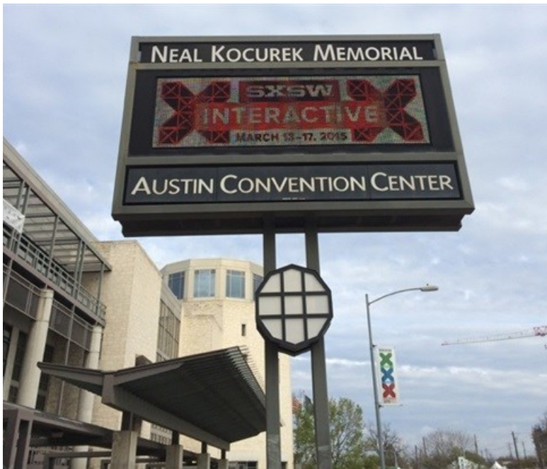
The Austin Convention Centre makes the ICC and CTIOC look teeny.

Now that I've expressed how hard it is to even scratch the surface of the content at SXSW, I'll tell you there are the usual endless invite-only and open parties that go with such a festival/conference, gorgeous restaurants and meeting spots and more food trucks than you can imagine. Austin is a fabulous city, a bit like Cape Town, just on a river and with more refried beans, pulled pork and tacos. It was less Texas than I imagined it would be (read: didn't see a single cowboy hat and no Dallas -inspired hairdos) and I'm pretty certain it's the de facto origin of the hipster beard and plaid shirt.