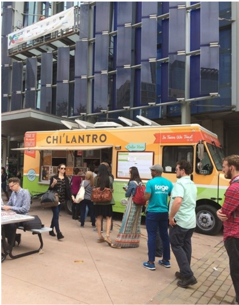
Food trucks, beards and plaid shirts.