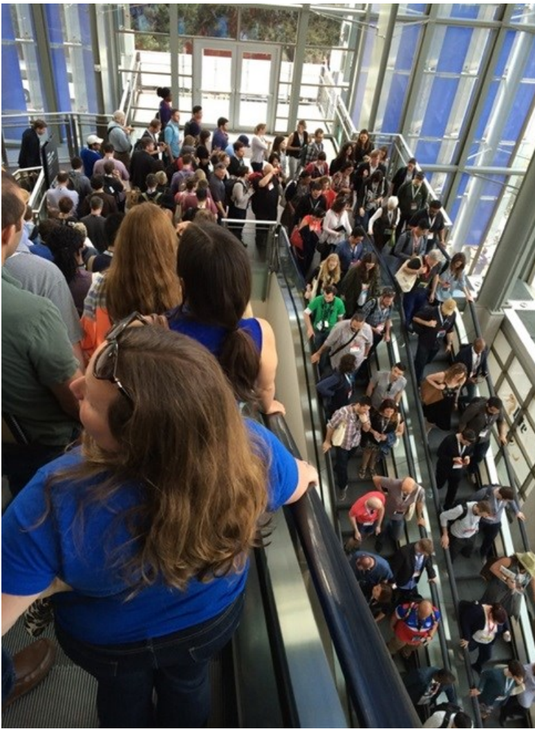
So much of people and plaid shirts