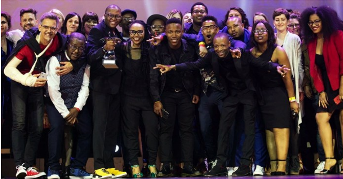
Joe Public United, on stage at Loeries 2018 after their 'Agency of the Year' win.