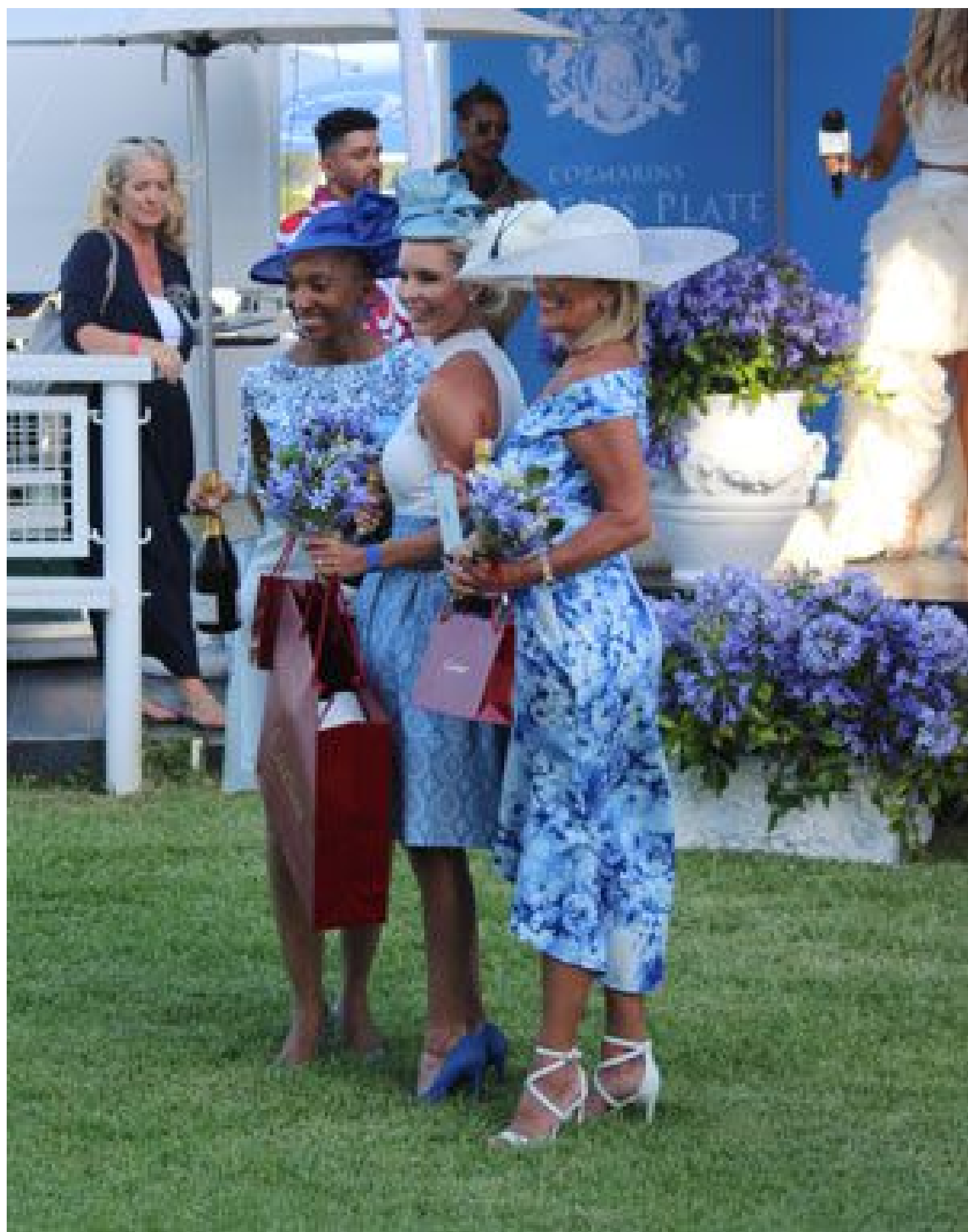
Best dressed females