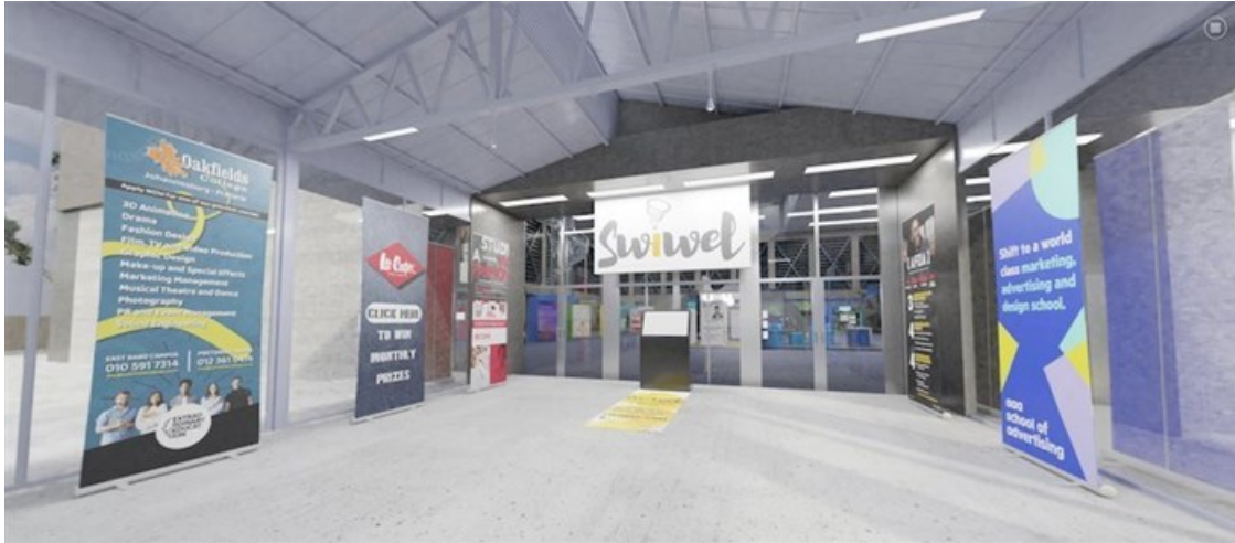
Image: Enter the Swiwel 3D career expo

Today, over half a million matriculants are learning that they have passed their final exams and are potentially eligible to apply for higher education. With many of those not even considering the possibility until now, where do they start looking? Enter Swiwel...