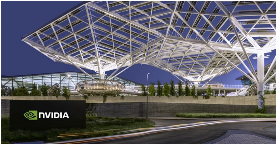
Nvidia head office, Santa Clara

Accelerated computing and graphics chipmaker Nvidia announced its impressive second-quarter earnings for fiscal year 2024. The company reported a revenue of $13.51bn, which is more than double the revenue from the same quarter a year ago and an increase of 88% from the previous quarter. Earnings per share (EPS) were also remarkable, with generally accepted accounting practices (GAAP) EPS of $2.48 and non-GAAP EPS of $2.70, both showing significant growth over the same period.