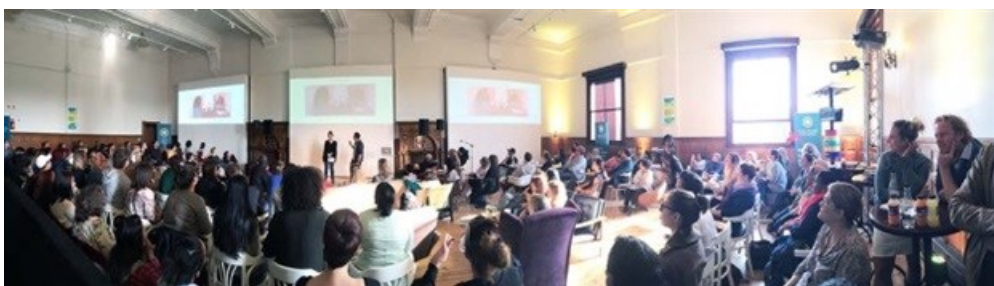
A scene from Open Design's CreativeMornings session.

Stassen believes if businesses are serious about driving change and transformation in their sector and also within their own business culture for the better, then they will eagerly take up the challenge to look through a design lens at their human resources and see every individual as a potential change-maker that has the ability to help them drive their various agendas. Integrating design thinking into the culture of a business presents a new landscape of opportunities to ensure the production of more relevant, marketable and people-friendly products and services.