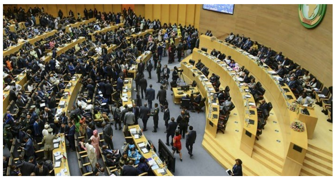
It's time the EU turned its rhetoric about Africa into more tangible action.

Since 2000, European and African leaders have been talking about giving the partnership between the two continents <u>a</u> "new strategic" dimension.