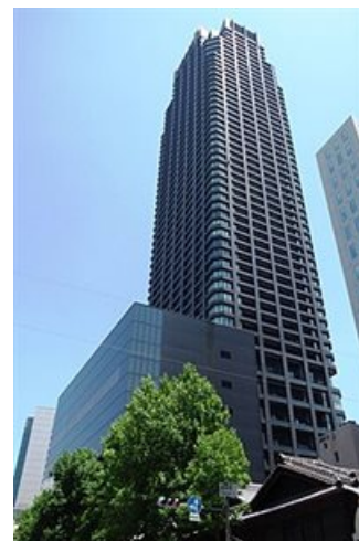
The Kitahama building, the tallest residential tower in Japan, is built with bendable concrete for earthquake resistance.

In New York and New Jersey , lawmakers have proposed state-level policies that would provide price discounts in the bidding process to proposals with the lowest emissions from concrete. These policies could serve as a blueprint for reducing carbon emissions from concrete production and other building materials.