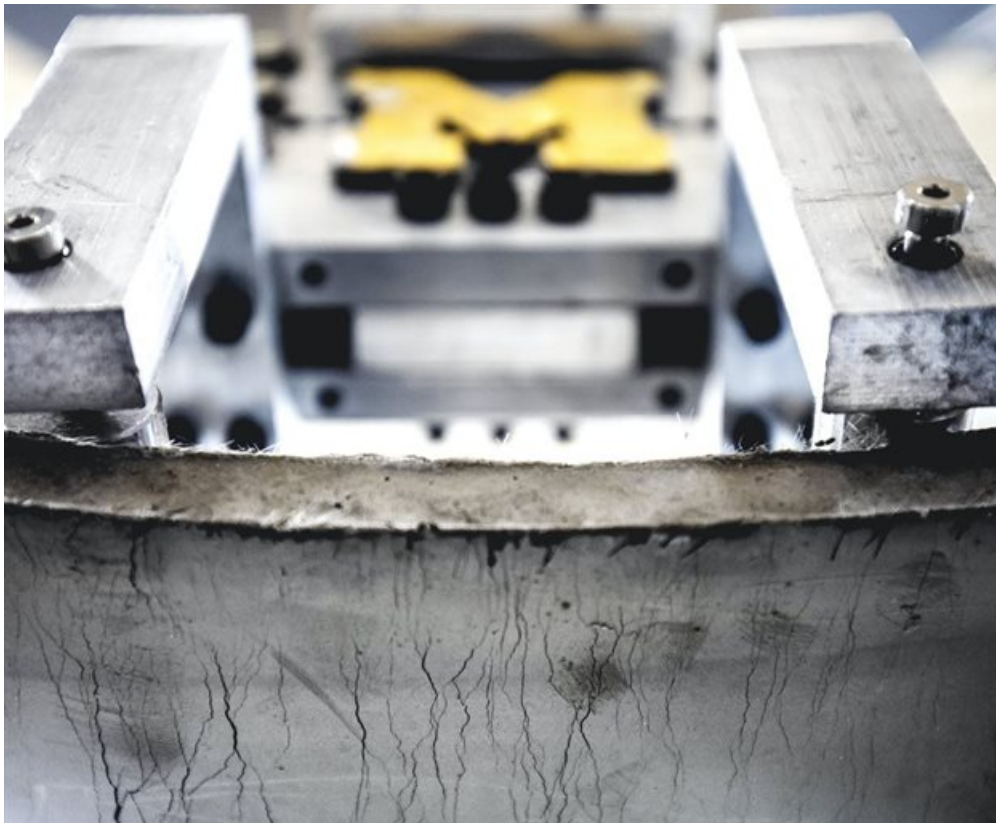
Bendable concrete created at the University of Michigan allows for thinner structures with less need for steel reinforcement.

One of the big contributors to climate change is right beneath your feet, and transforming it could be a powerful solution for keeping greenhouse gases out of the atmosphere.