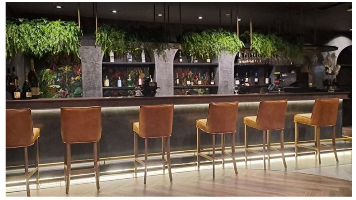
Grotto Spa Bar.

From the Obsidian Prelude lounge, Grotto Spa bar, serenity nests, a reflection heated hydrotherapy pool, a polar plunge pool, and hand and foot oasis to the steam retreat, sauna oasis and mineral mist rasul, the interior is certainly something out of this world.