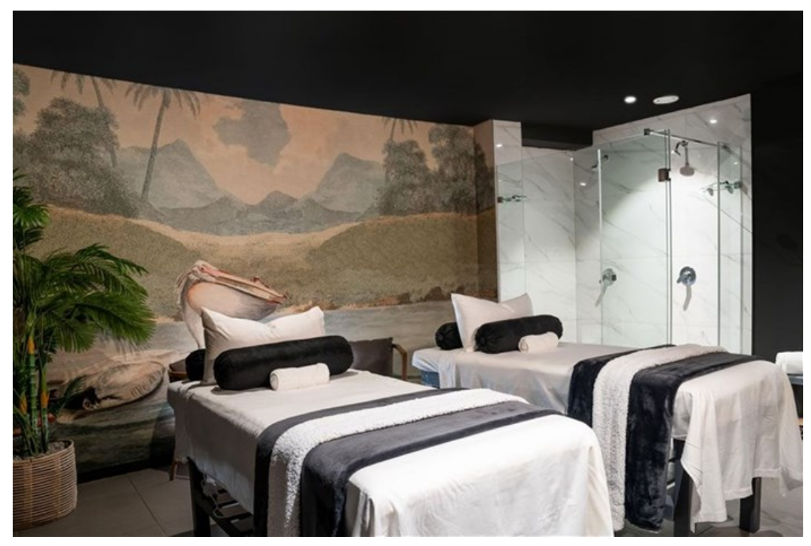
Treatment Room Image supplied

The massage therapist that I selected demonstrated exceptional skill, and the massage was tailored to address my specific needs.