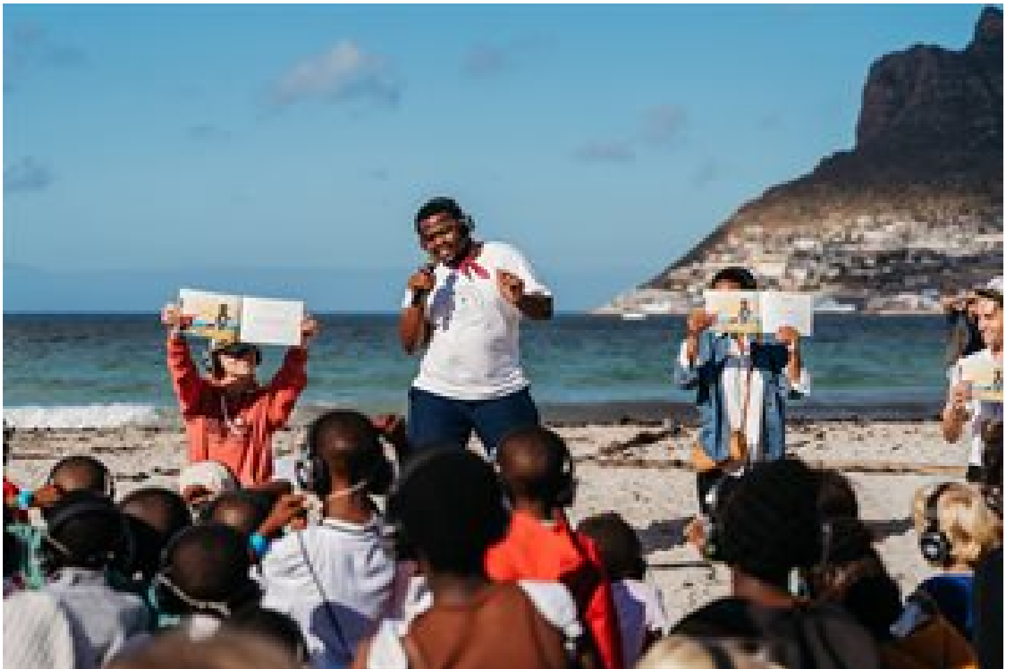
The Fanplastic Dance took place on 2 March 2024 at Hout Bay Beach, kicking off with a captivating storytelling from Captain Fanplastic, then City of Cape Town’s Bingo the bin offered a lesson to remember. After an energising dance