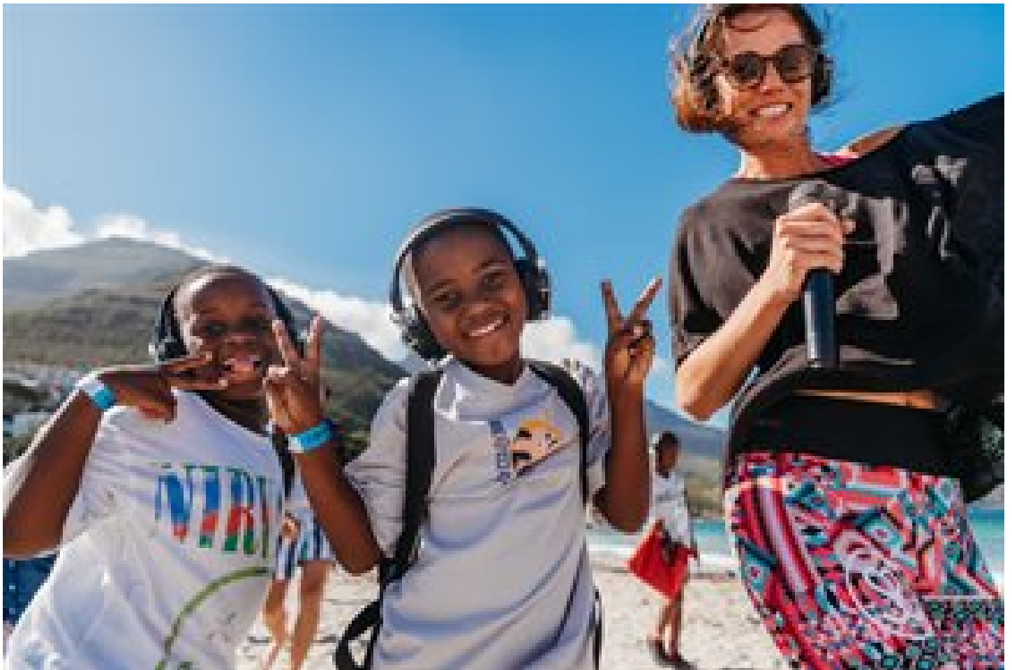
Captain Fanplastic is dedicated to contributing to the United Nations Sustainable Development Goals (SDGs), particularly Goal 4: Quality Education, Goal 14: Life Below Water and Goal 12: Responsible Consumption & Production among others.