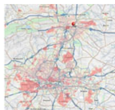
Population Density Heat map