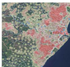
Heat map with Suburb Layer