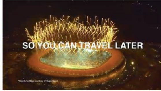
Team South Africa - Call Up

Directly, South African Tourism challenges the idea of a destination brand to communicate during a global travel ban - and still, ultimately, putting local culture, heritage and community at the heart of its message. By doing so it negates the preconceived notion of tourism as being reliant on external visitors, rather than thriving on local people, being locally appreciated.