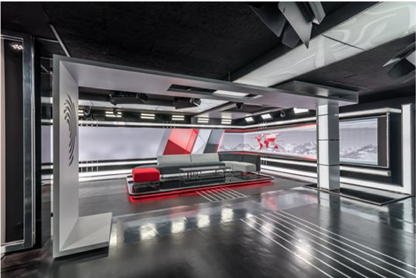
click to enlarge