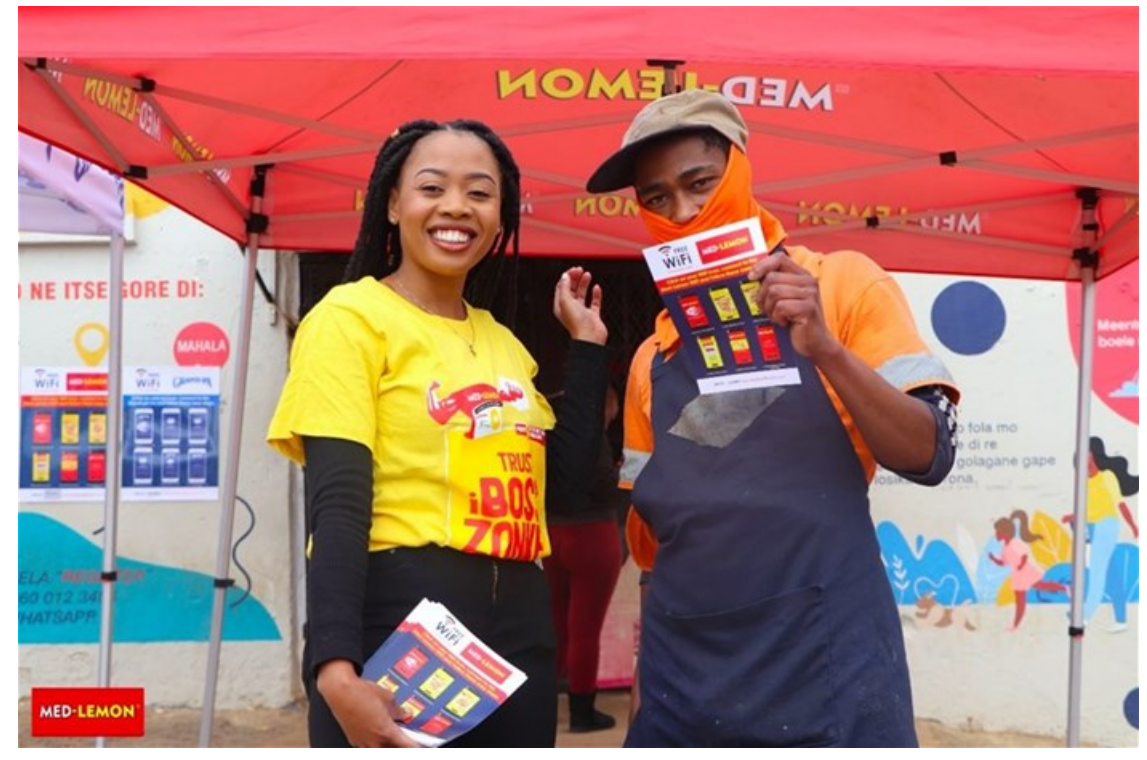
Med-Lemon activation in Sow eto

"Through the Wi-Fi service, we have been able to simultaneously increase brand exposure for consumer brands and offer a 'connectivity lifeline' for small business. We're boys from the kasi, our roots run deep, so we're always looking for ways to give a hand-up to young township startups. We're putting our money where our mouth is and doing everything, we can make the small business circle bigger," concludes Molefi.