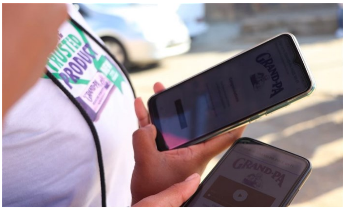
Grand-Pa activation in Tembisa

Startups, small business and micro-entrepreneurs are enjoying a 'connected hand-up' thanks to the expansion of free Wi-Fi zones across Gauteng's townships. These Wi-Fi spots can be found in bustling townships such as Dobsonville, Naledi, Diepkloof and Tembisa to name a few.