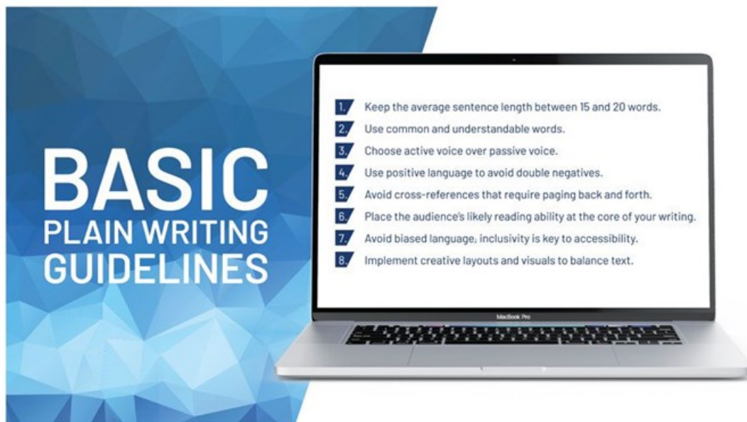
Figure 1: Summary of basic plain writing guidelines. (Source: EDGE Education (Pty) Ltd, 2023; adapted from Cutts, 2013: xxxi–xxxii)

However, plain language is so much more than a set of guidelines for writing effective content. In fact, it has evolved into a global movement that places itself at the centre of accessible and equitable communication.