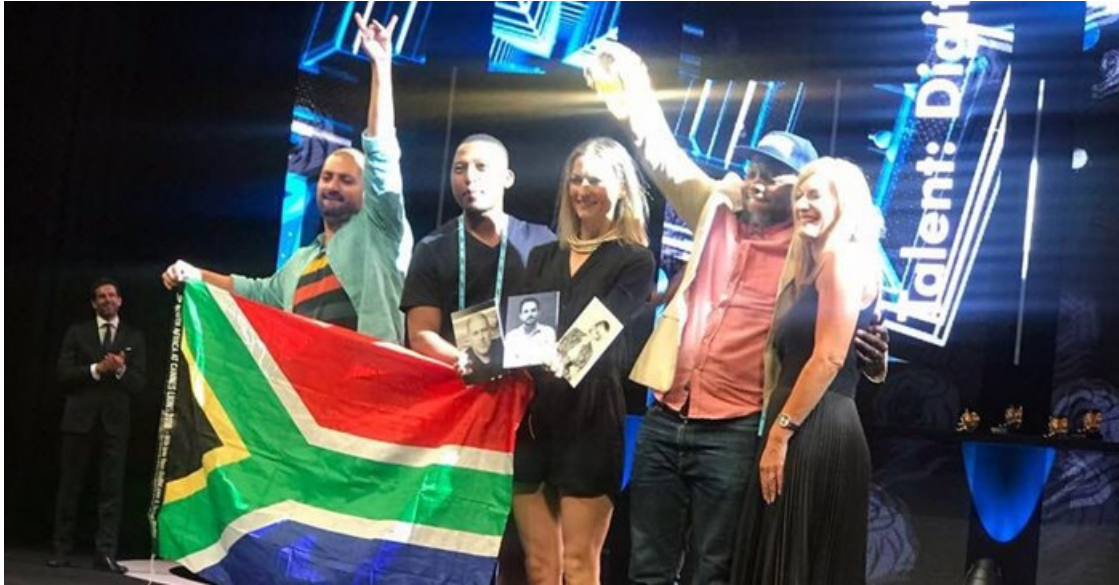
Team TBWA\Hunt\Lascaris representing SA at Cannes Lions 2018.