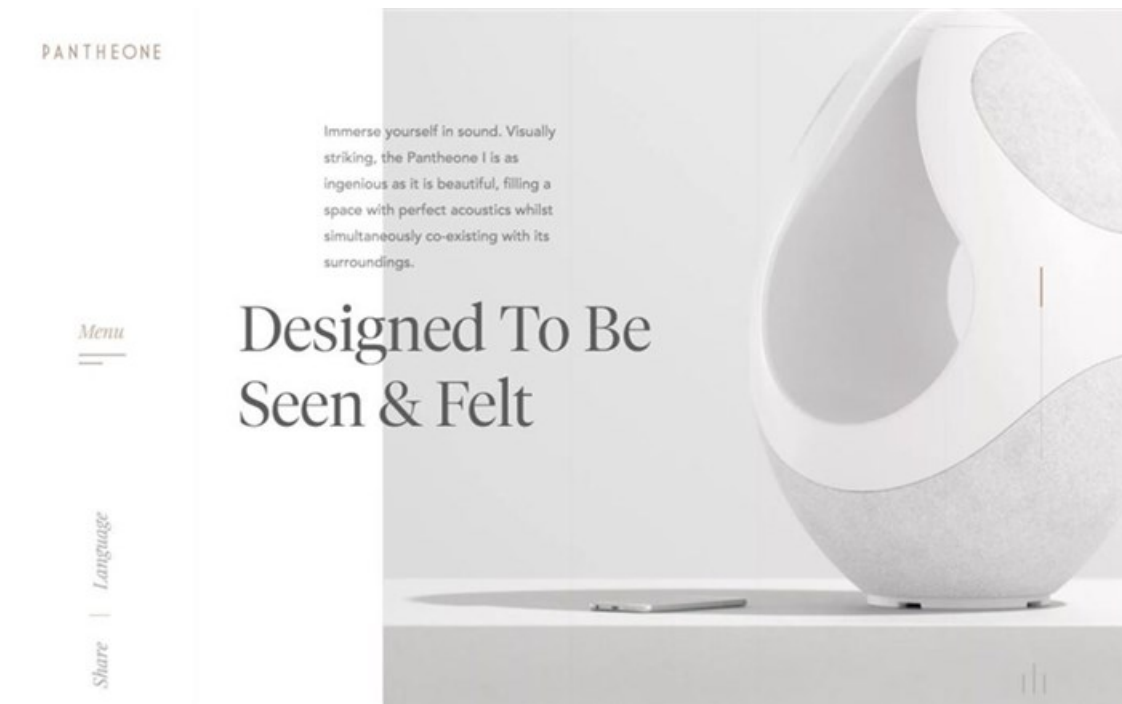
Pictured above: Pantheone Audio Website

South African digital design studio, MakeReign , has been recognised on an international level after being awarded an Awwwards Site of the Day (8 January 2020) for the recently launched Pantheone Audio website.