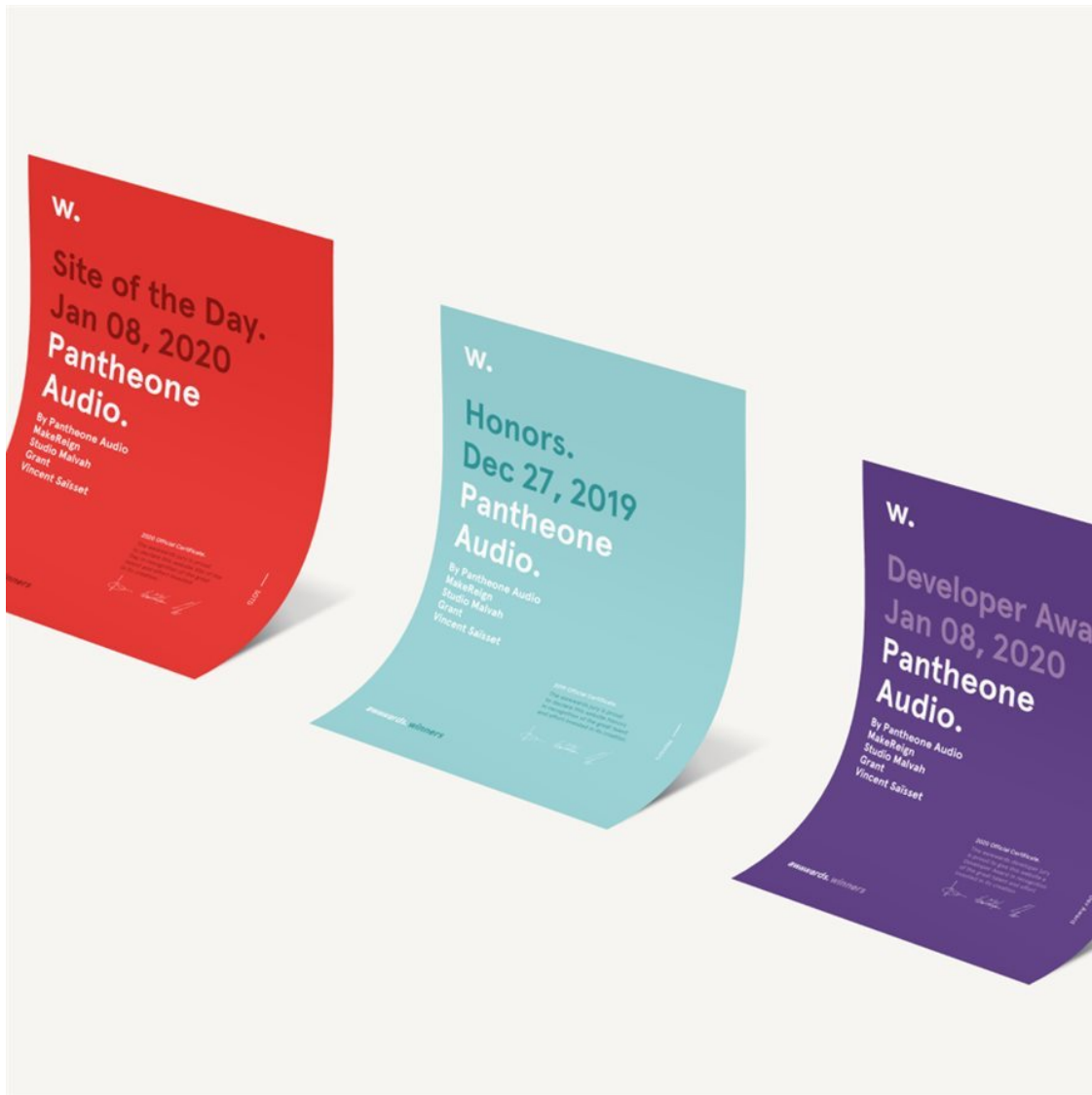
Pictured above: Awwwards SOTD (8 January), Honors (December 27 2019) and Developer Award (8 January).

The Pantheone site also scooped a number of awards from the CSSDesignAwards (21 January 2020), winning Site of the Day , and was voted by the public to win Best UI Design, Best UX Design and Best Innovation!