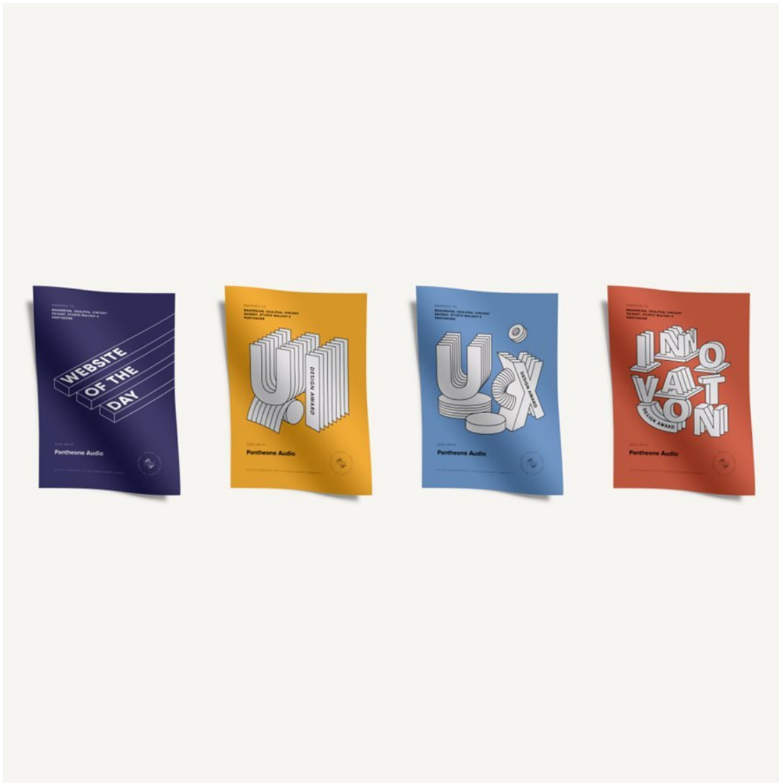
Pictured above: CSSDesignAward Site of the Day (21 January), Best UI Design, Best UX Design and Best Innovation!