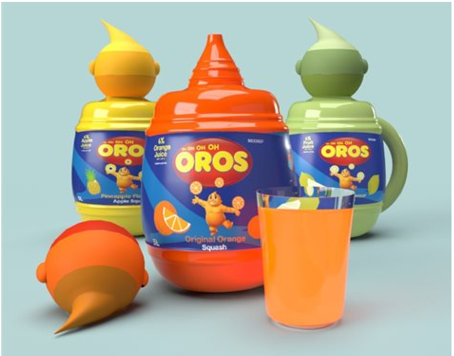
Malaika Mukelwa Fraser's Oros bottles