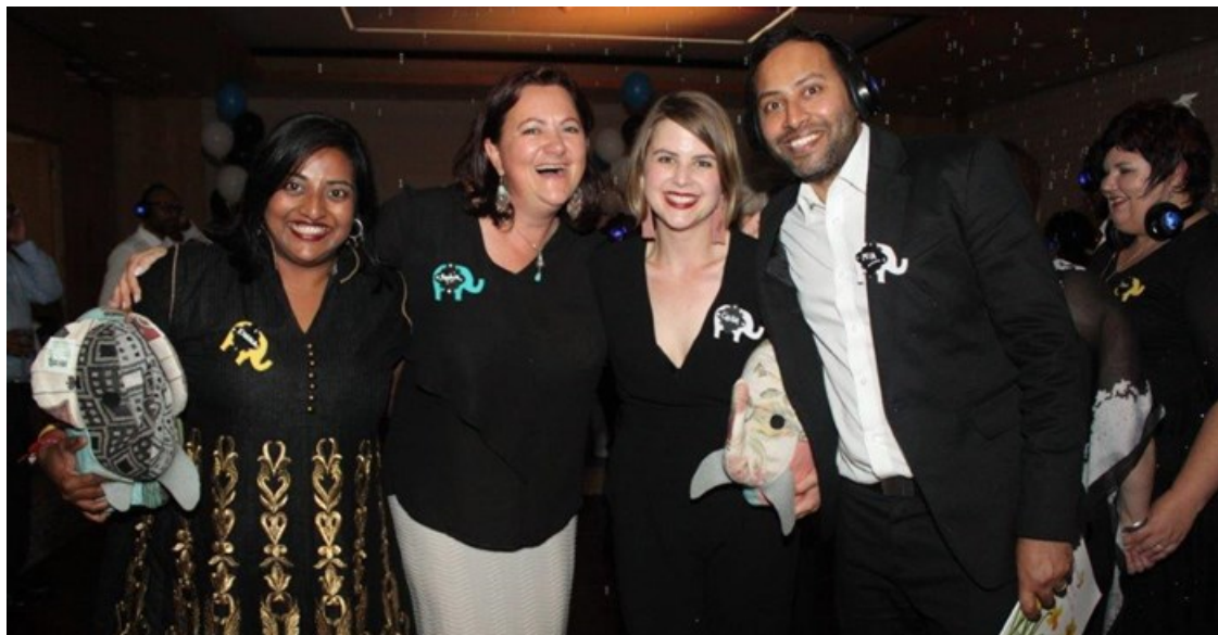
Dancing with elephants.