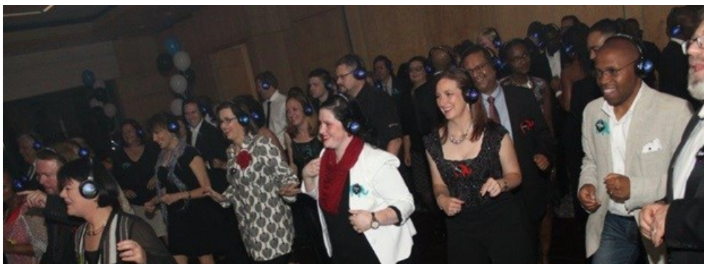
Silent disco - elephant stomp style.

Shifting focus from global gold to local silver, we were told that the matriarch is the leader of the elephant herd and it was time to release all our inner elephants in celebration, silent disco style to the Cha cha slide – Mississippi Stomp version, thank you very much!