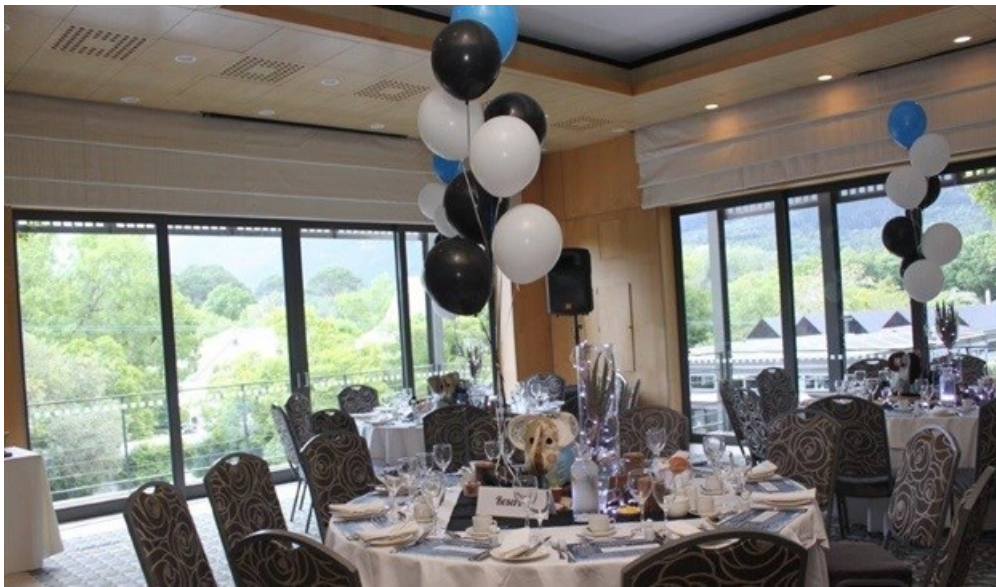
Colours of Botswana.