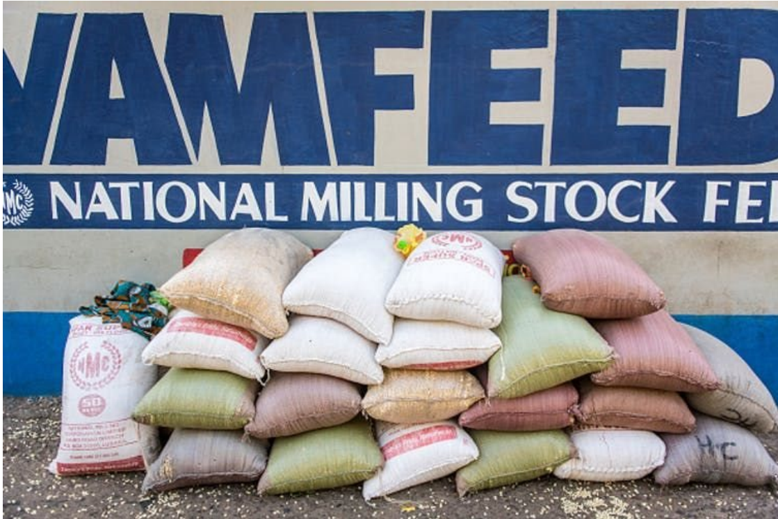
Maize is the staple food in Mozambique, consumed across the country and predominantly by the poorest households.

Investments in infrastructure - such as roads - typically aim to reduce transport costs, stimulate trade and make new production activities viable. Across sub-Saharan Africa, the need for such investments is widely acknowledged .