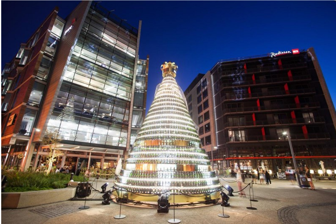
Moët & Chandon Champagne Christmas Tree

The social media-activated Moët & Chandon Christmas tree out of recycled champagne bottles just because it was so spectacular and the location right next to the Zeitz MOCAA in the V&A's Silo District was perfect!