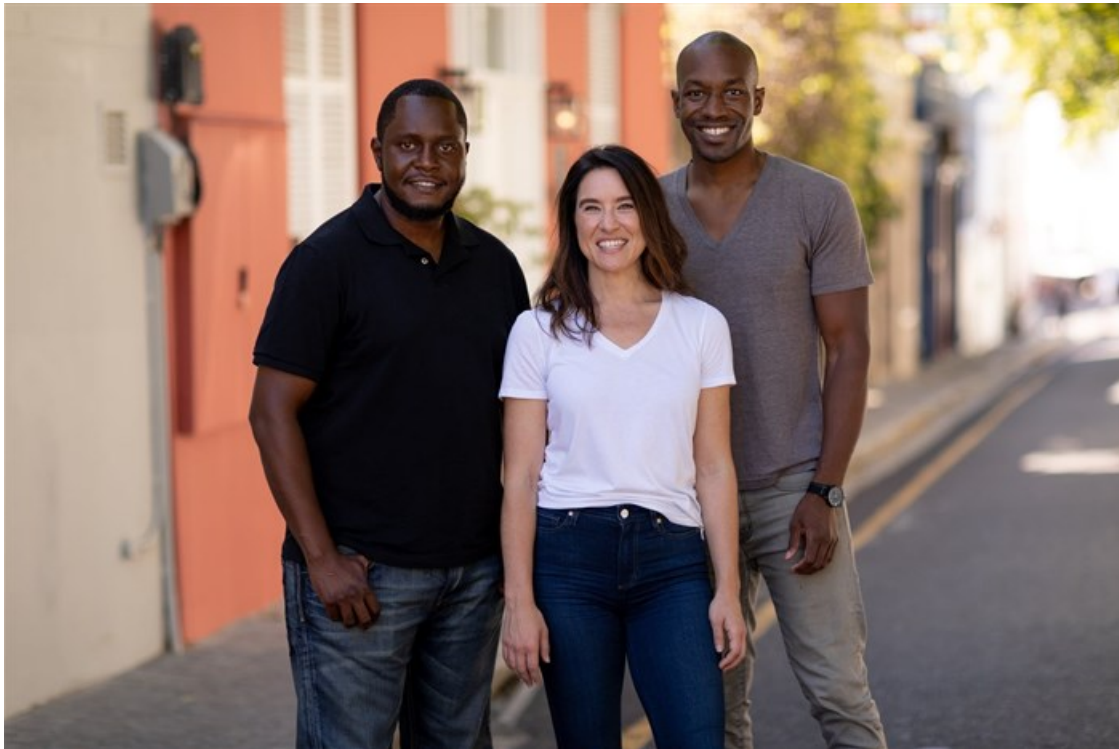
Carry1st's co-founders