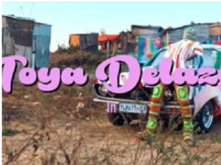
Film - Bronze

The Loeries concluded the 2020 awards with Film, Film Craft, Grand Prix, Brand of the Year, Agency of the Year award, Regional Agency Group of the Year awards. Throughout Loeries Creative Week, a total 264 Loeries were awarded across 16 categories, including five Grands Prix, 28 Golds, 63 Silvers, 110 Bronzes, 14 Craft Golds and 44 Craft Certificates. The awards honour the best in brand communications across Africa and the Middle East. Here is the gallery of winners from day five.