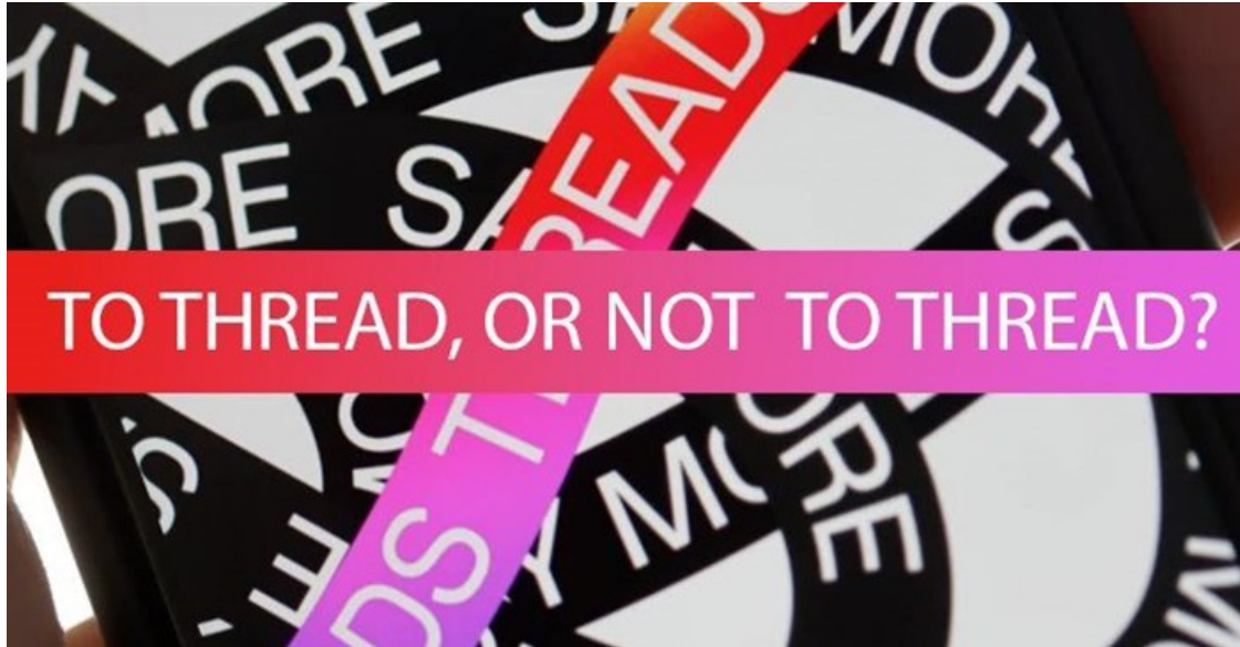
Image supplied. Tara Turkington CEO of Flow Communications asks to "Thread" or not to "Thread"?...

Threads - Meta's new challenge to Twitter - has exploded onto the social media scene, quickly sewing up over 30 million users within three days of launching.