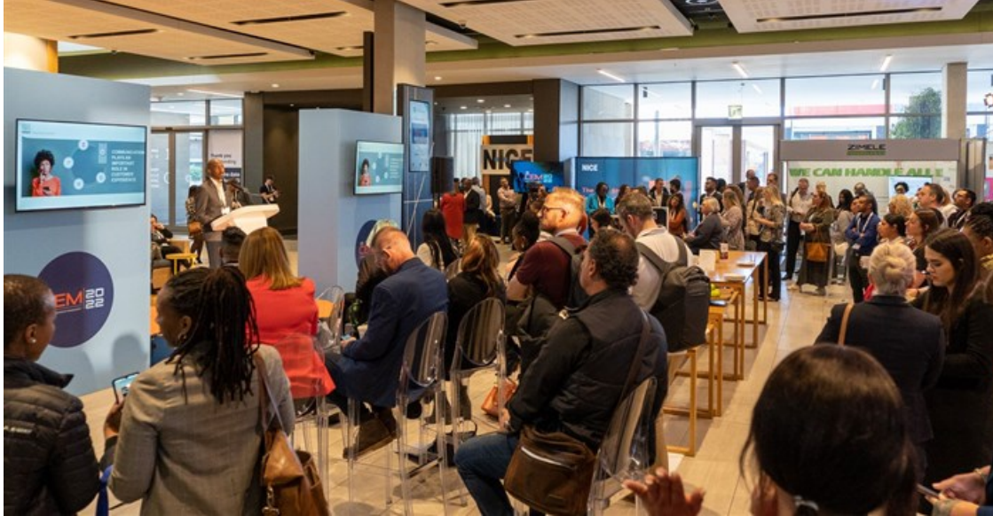
CEM Africa 2023 takes place today and tomorrow in Cape Town.

The customer experience landscape is undergoing a significant transformation in 2023, with Artificial Intelligence (AI) emerging as the central driver of change.