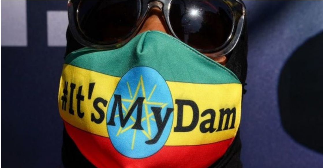
Ethiopian protestors march down 42nd Street in New York during a "It's my Dam" protest on March 11, 2021.

For several years, political tensions between Ethiopia, Sudan and Egypt have been escalating in a conflict over the near-complete Grand Ethiopian Renaissance Dam (Gerd). The Gerd is Africa's largest hydropower plant. It dams the Blue Nile river coming from Ethiopia's highlands just before it crosses into Sudan where, after merging with the White Nile, it continues northwards to Egypt.