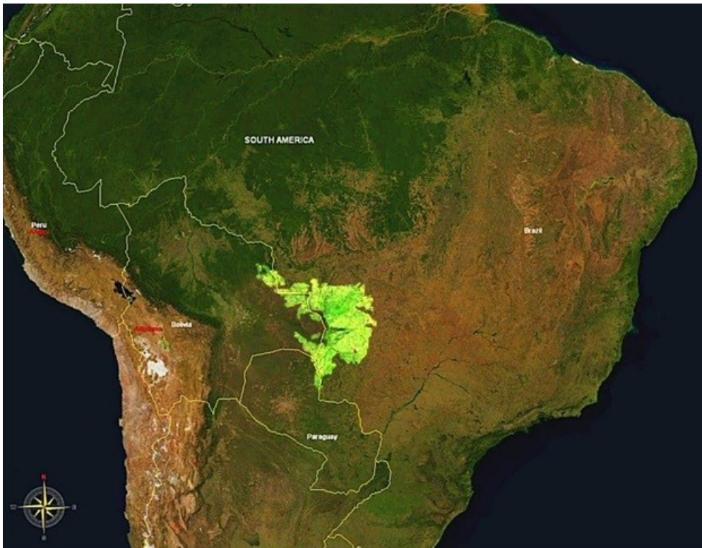
Pantanal is flanked by Brazil's highlands (brown). The Amazon rainforest lies to the north.

This mixture of natural resources and fertile land means Mato Grosso has a long history of environmental issues. However, if the state today is recognised as a deforestation hotspot , soon it may be known for its dams. This is because the height difference between the rainy plateau in the north of the state and its southern plains means there is lots of hydroelectric potential .