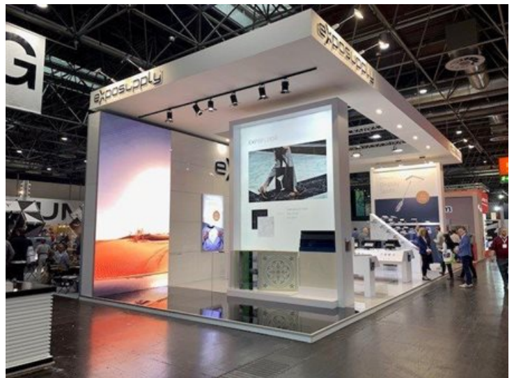
Digital innovation: More screens than walls.

Holograms and projections offer another way to create moving and changing visual displays. And just as LED screens are going onto all kinds of surfaces, so too are projections – onto floors, mesh fabrics, Perspex and other transparent materials, all of which creates interesting effects and textures.