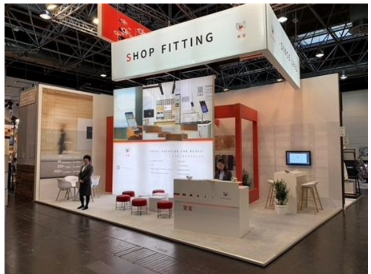
Lighting: Lightboxes creating vibrant graphics.

As touched on in the lighting trends, energy efficiency is on the rise and was especially evident in retail applications like low-energy refrigeration.