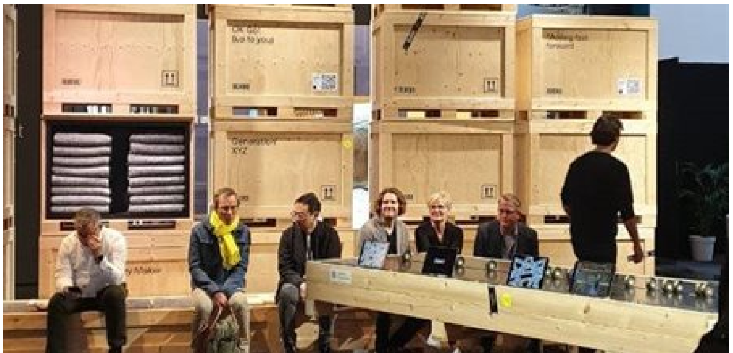
Stand made from repurposed untreated wooden crates.