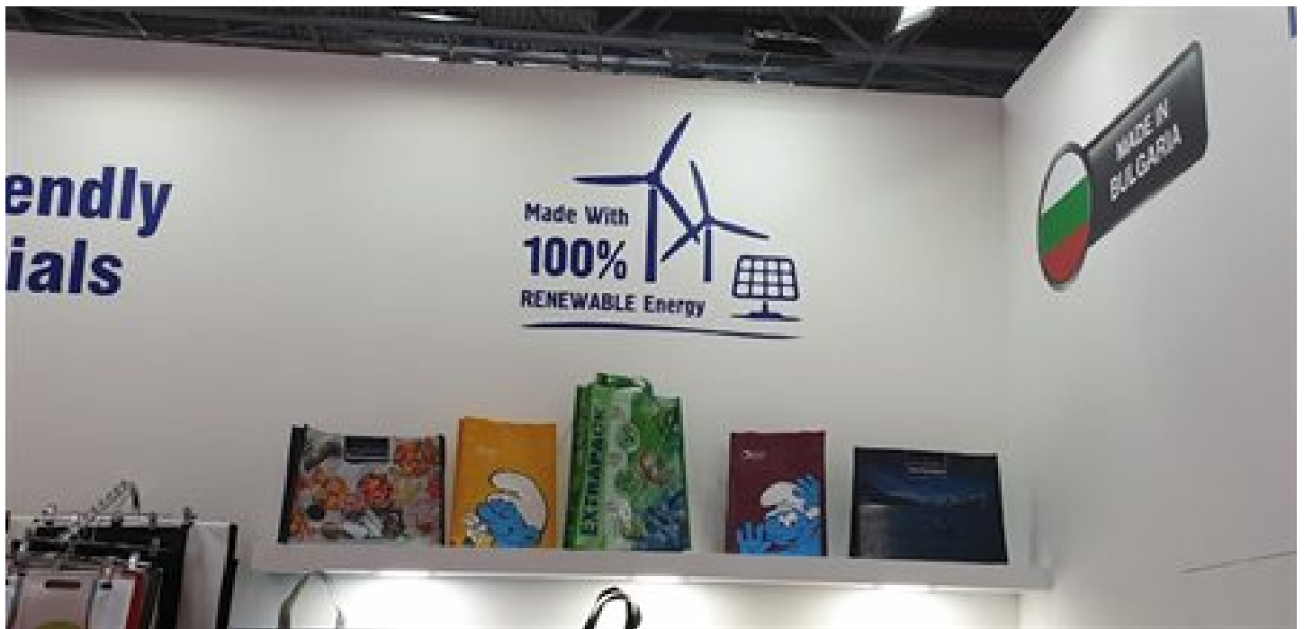
Sustainability: Signage explaining that products are made with renewable energy.