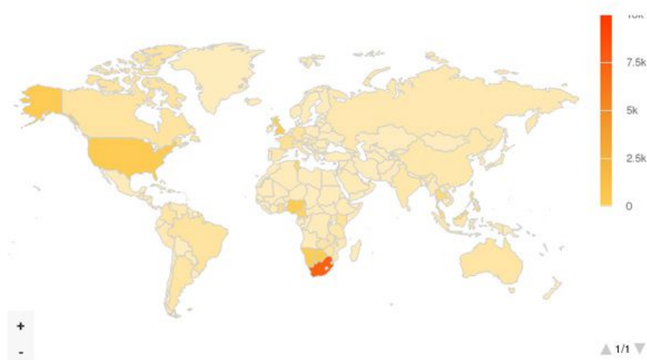
Global Heat Map of Social Media Mentions on 'Shudufhadzo Musida' and '#MissSA2020' between 24 October and 27 October 2020

The theme for this year's Miss South Africa was 'Face Your Fear. Embrace Your Future', which is a theme that the data picks up in light of Shudufhadzo becoming the new Miss South Africa 2020, and how there is no doubt that she will indeed embrace the new future that awaits her.