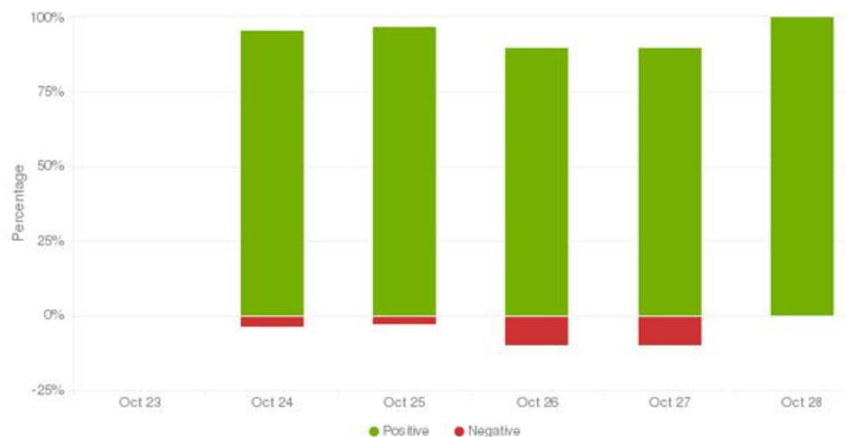
Social Media Sentiment Analysis of 'Shudufhadzo Musida' in South Africa between 24 October and 28 October 2020

South Africans are not the only ones who have taken a warm liking to their new Miss South Africa 2020; 'Shudufhadzo' has also been mentioned beyond South African borders.