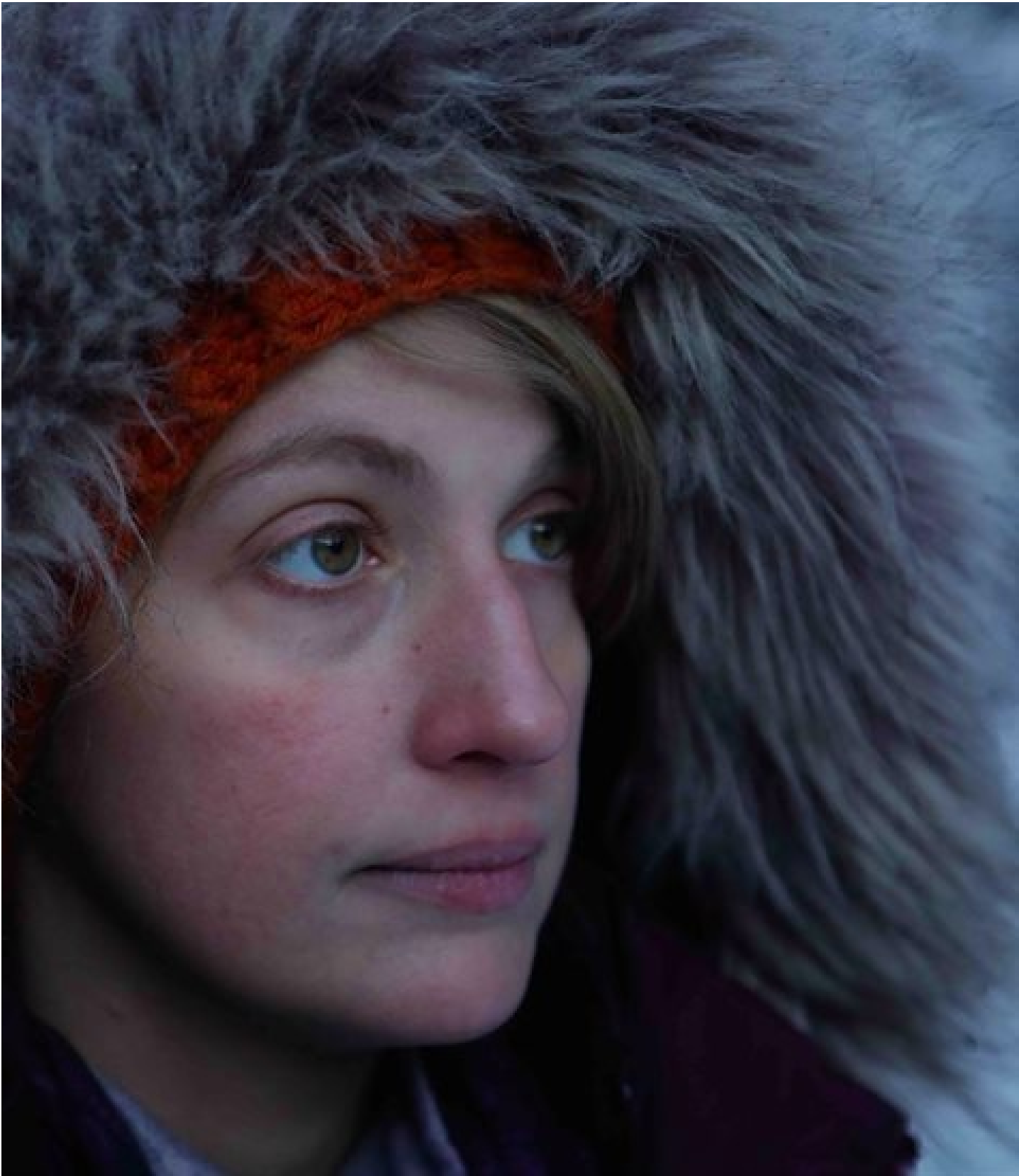
Alaska The Next Generation