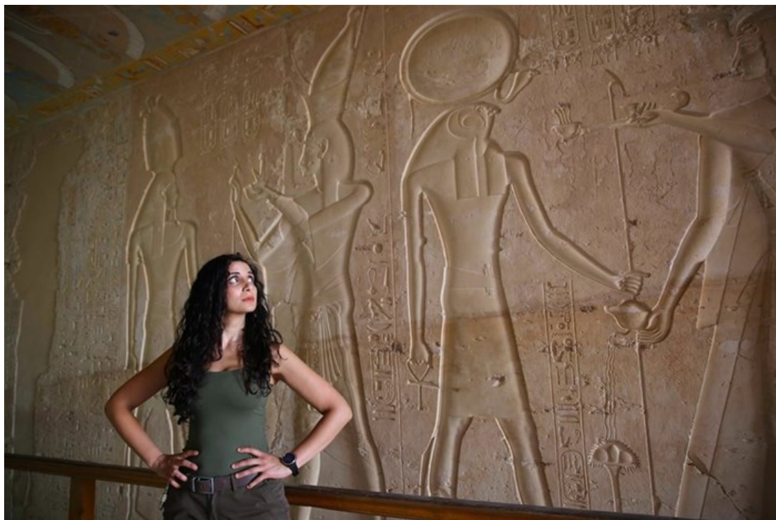
Tut's Toxic Tomb

In Lost Treasures Of Arabia , premiering Friday 28 October at 7pm, we investigate AlUla's unsolved mysteries and unravel the many dramas that played out on this ancient stage. This television special features reveals the historical heritage, exquisite natural assets and the immense legacy of art that continues to inspire future generations in this middle eastern city.