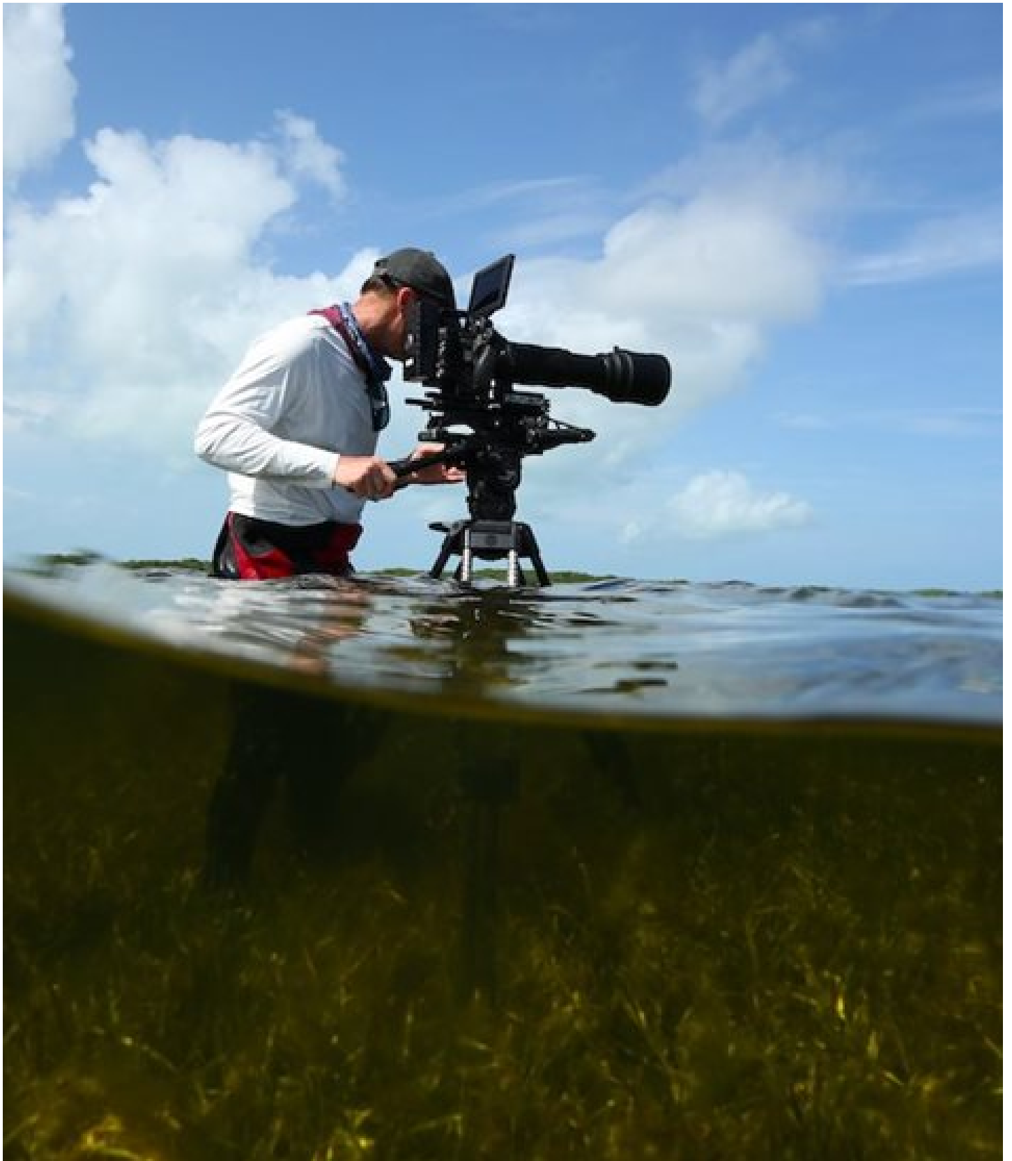
America's National Parks

The Walt Disney Company Africa today announced the upcoming content slate for both National Geographic and National Geographic Wild for spring/summer 2022. With a promise to ignite the explorer in all of us, and with a 133-year legacy, viewers across the continent will also be able to immerse themselves in the very latest and ground-breaking storytelling in stunning high definition for the very first time, taking them further than ever before.