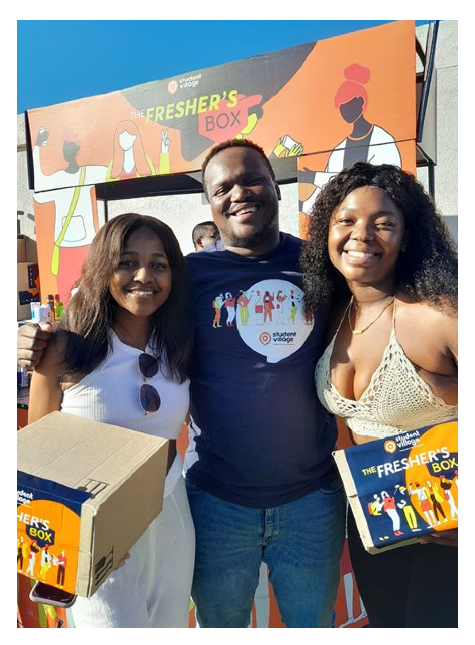
About Student Village