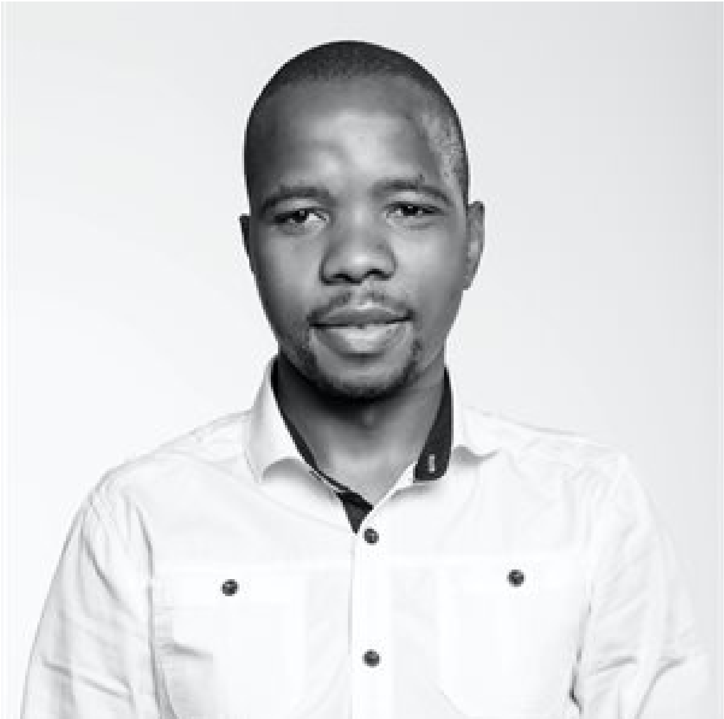
Joe Public Johannesburg