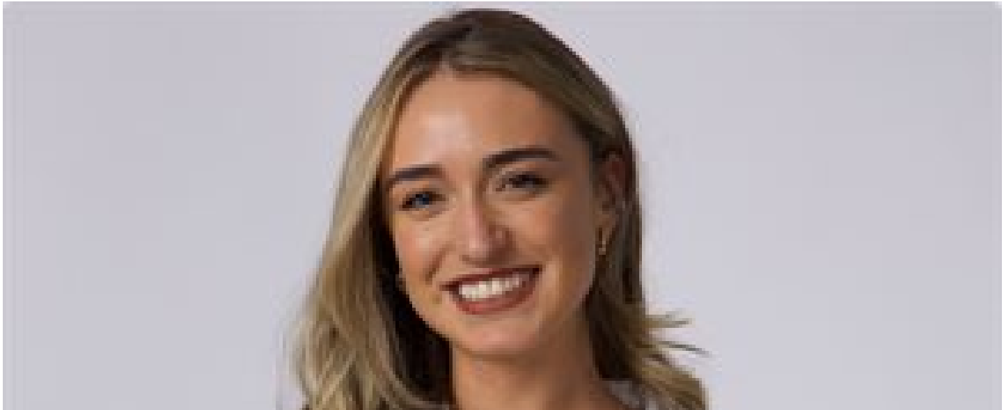
Joe Public Johannesburg