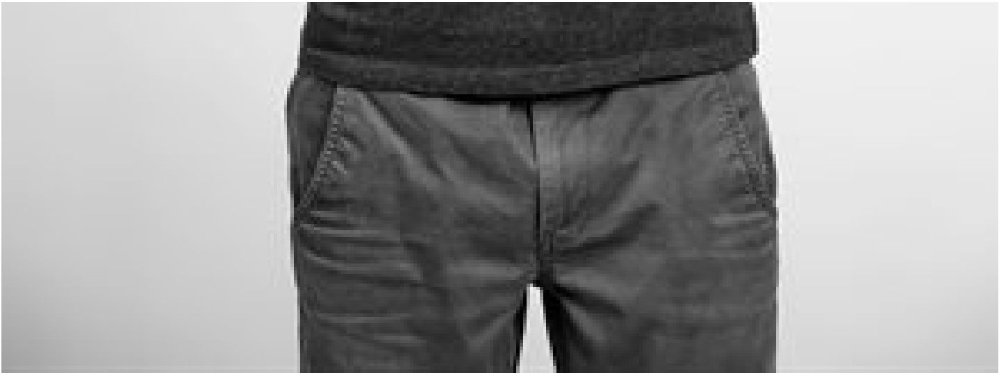
Declan Sharp Integrated creative director