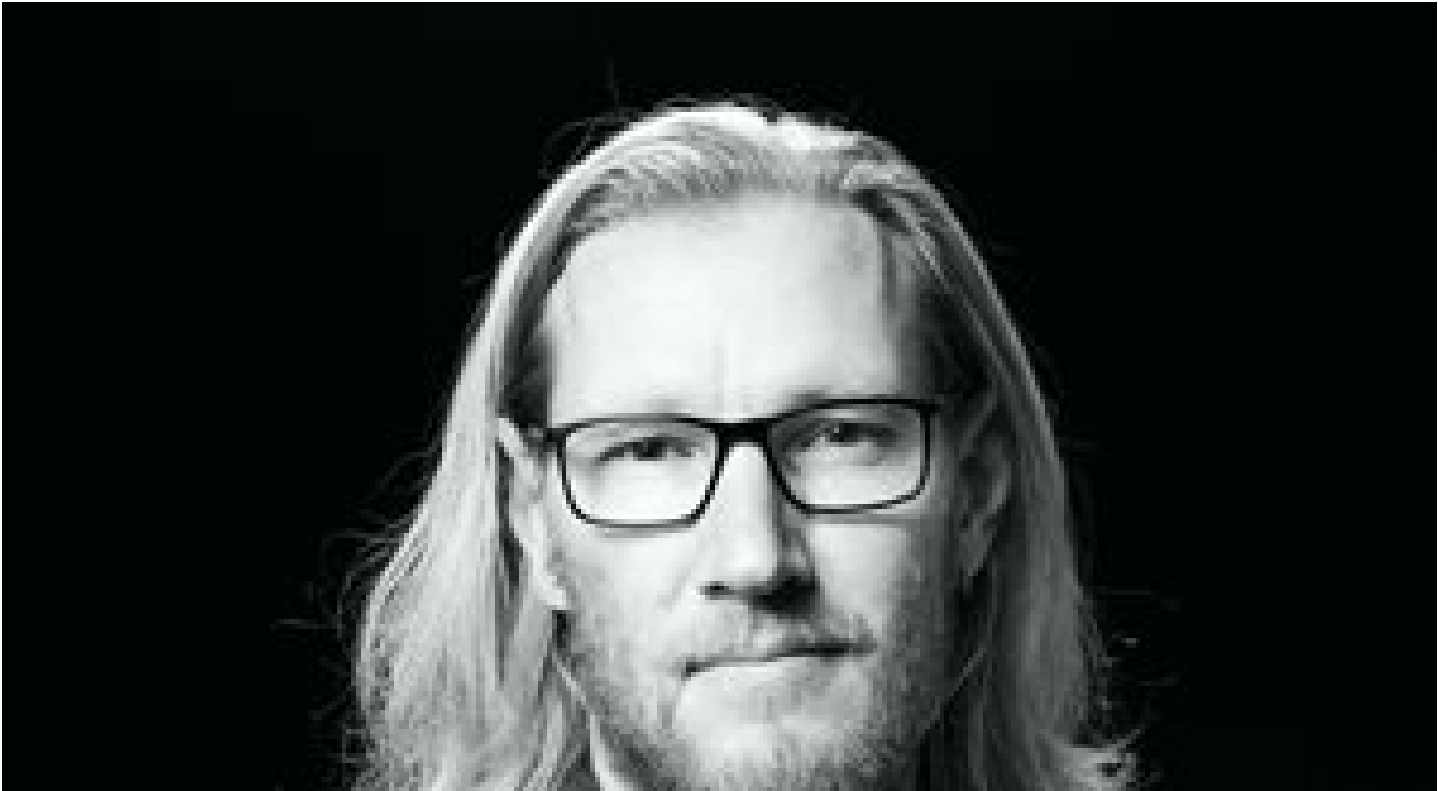
Joe Public Johannesburg