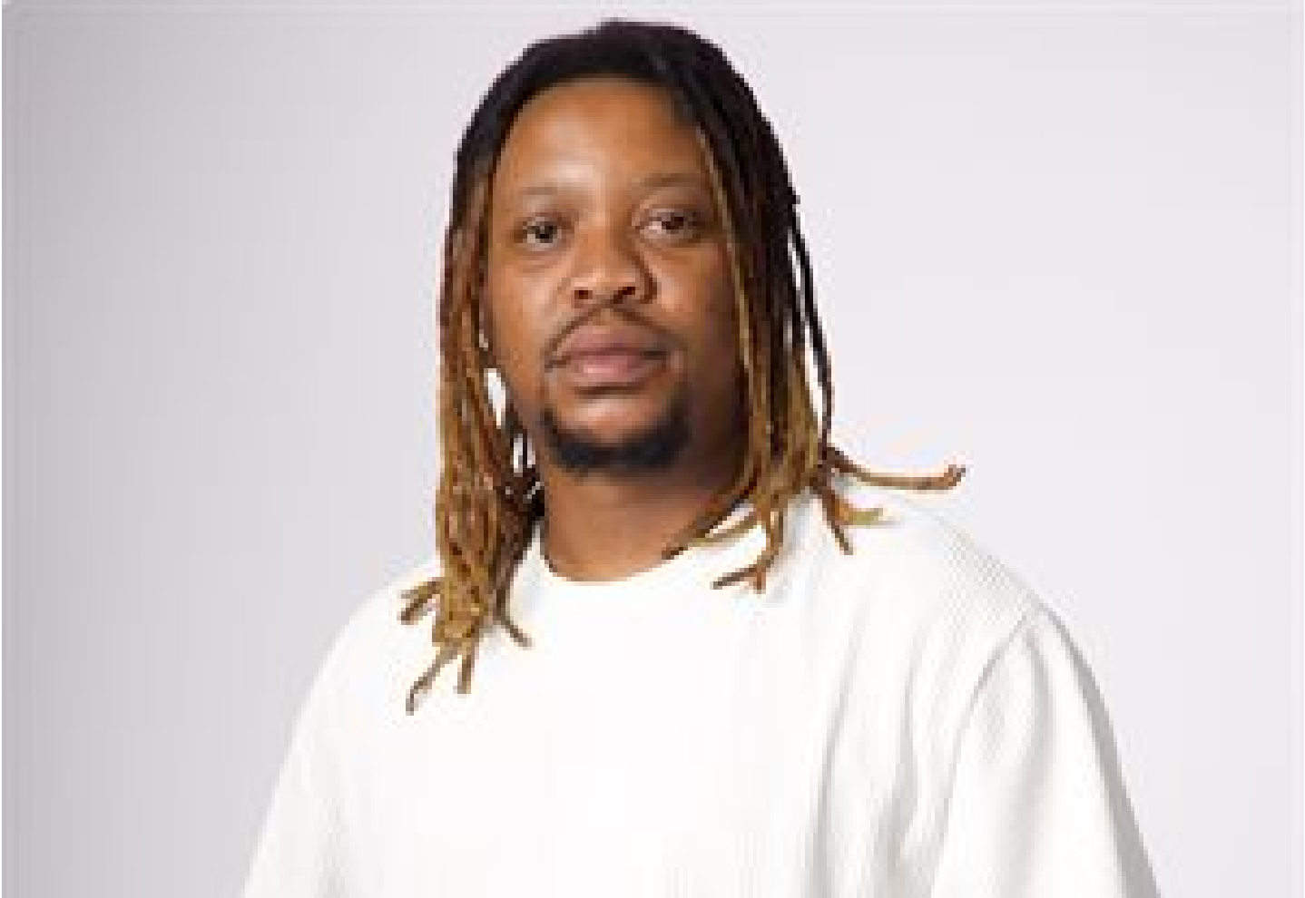
Joe Public Johannesburg