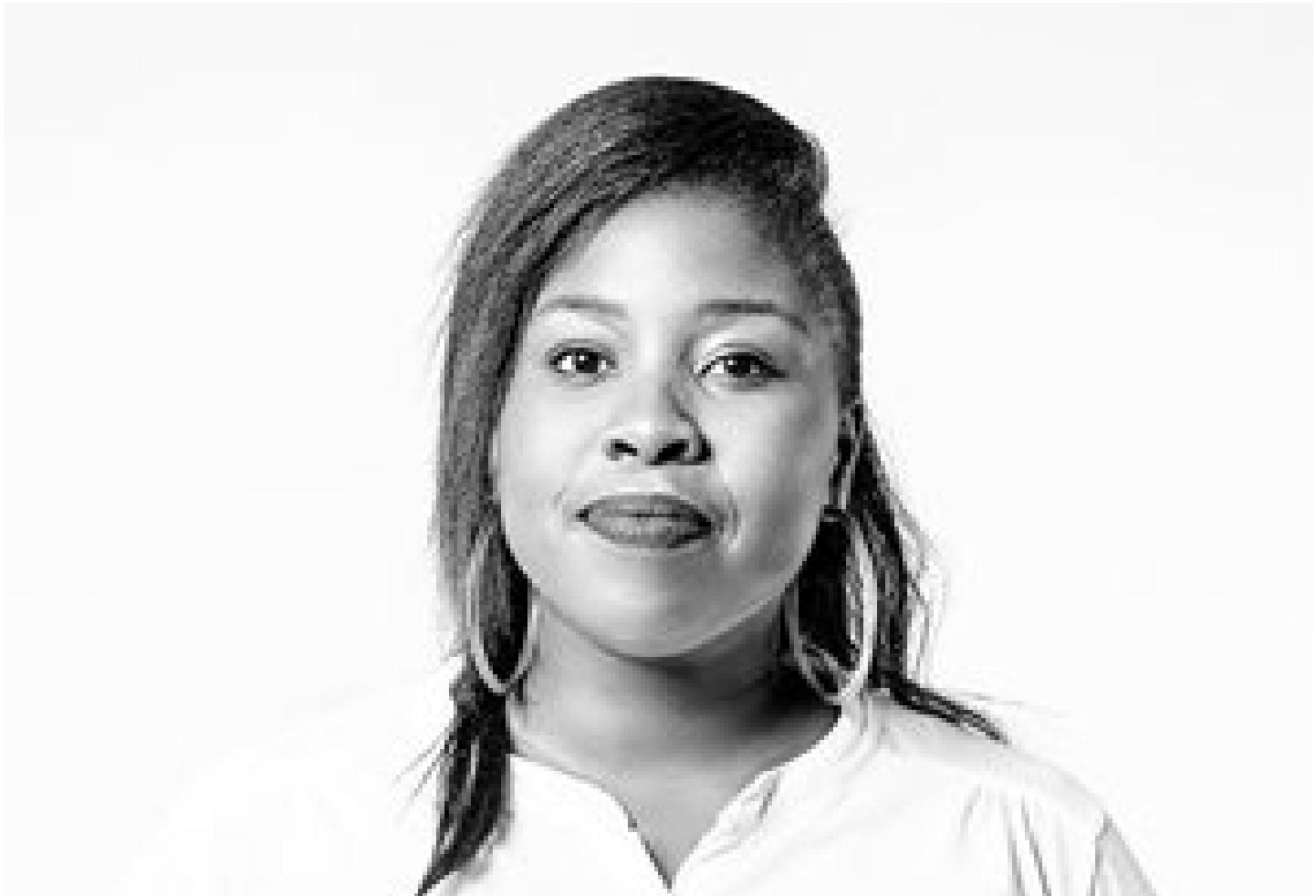
Joe Public Johannesburg