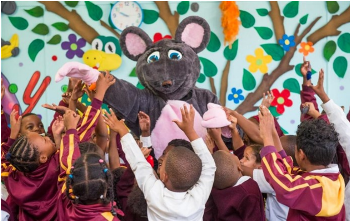
Coronation and its literacy partner Living Through Learning hosted the city-wide occasion at the schools' fun-filled Reading Adventure Rooms.

Coronation and its literacy partner Living Through Learning spread joy at all their beneficiary schools and Reading Adventure Rooms in Cape Town as the learners read The Mouse Who Ate the Moon .