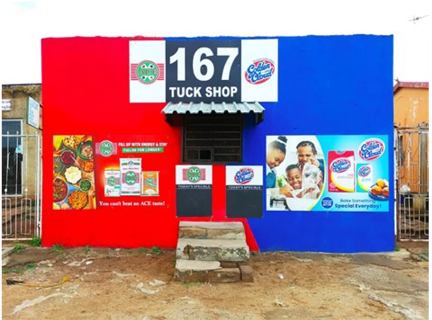
After – Golden Cloud and Ace spaza branding