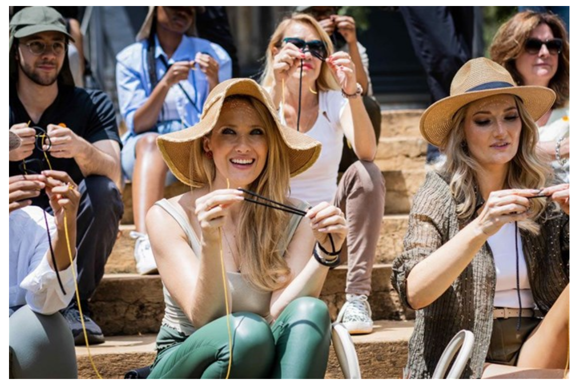
Guests learning to tie knots.

On the last day, Hazen spent the morning at the Lesedi Cultural Village on Friday morning, filming a profile piece for a local television magazine show. The week finished with a shoot of content pieces and inserts for Nat Geo Africa's owned channels, that will be used in the promotion of the series' premiere and run from 22 November across Africa. An additional fun content piece was shot with Nat Geo Explorer paleoanthropologist Keneiloe Molopyane.