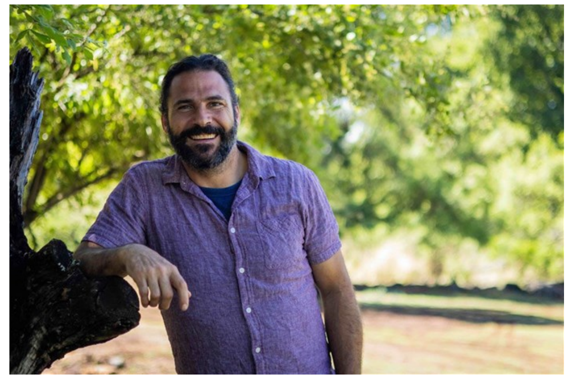
Hazen Audel in South Africa

On Wednesday, 8 November, 90 press, influencers and ad sales partners travelled to the Cradle of Humankind World Heritage Site. In the heart of the bushveld and the warmth of the South African summer, guests were welcomed to an eventful launch. On arrival, they were immediately immersed into the programming as they had to identify animal droppings and tracks, before heading into the venue.