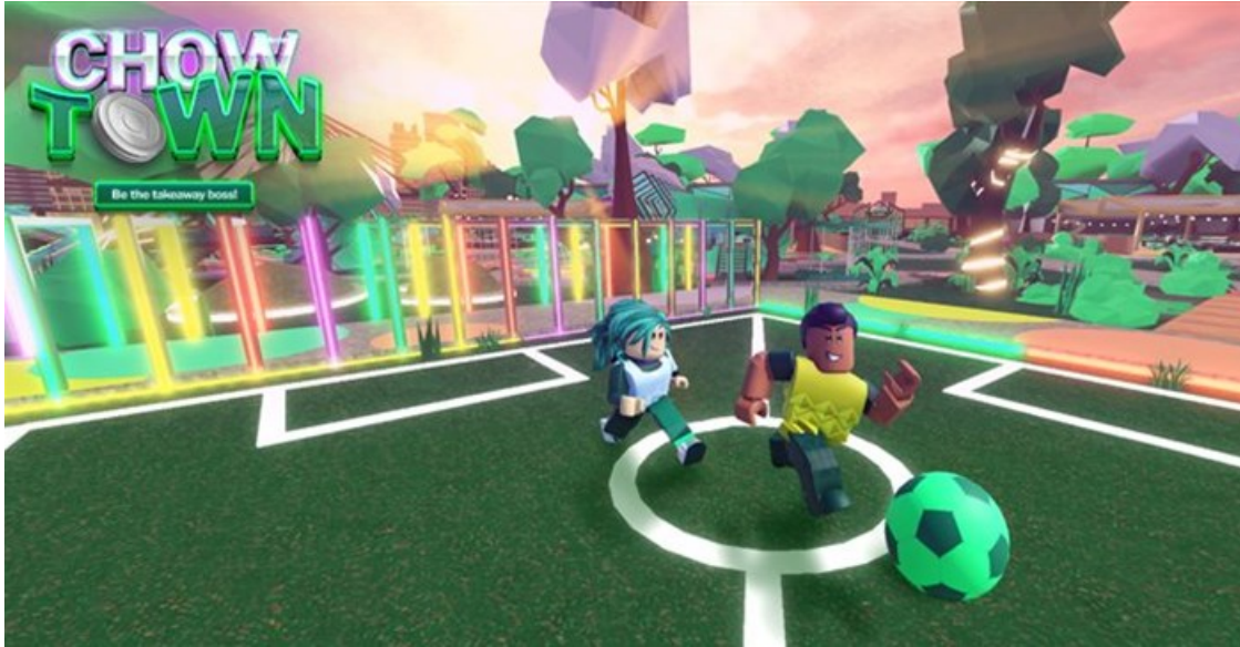
Nedbank's Roblox Chow Town campaign engages pre-teens in an interactive and educational gaming experience within the virtual world of Roblox.

Nedbank launched the Roblox Chow Town campaign to engage pre-teens in an interactive and educational gaming experience within the virtual world of Roblox to teach them financial literacy skills while having fun.