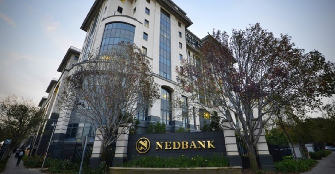
ESG News A Scopen study has found that Nedbank, Nando's and Absa the 'ideal' clients, and the most attractive brand for agencies

Nedbank, Nando's and Absa are the top three brands that professionals would like to work with says the Scopen's Best Marketer to Work with Study.