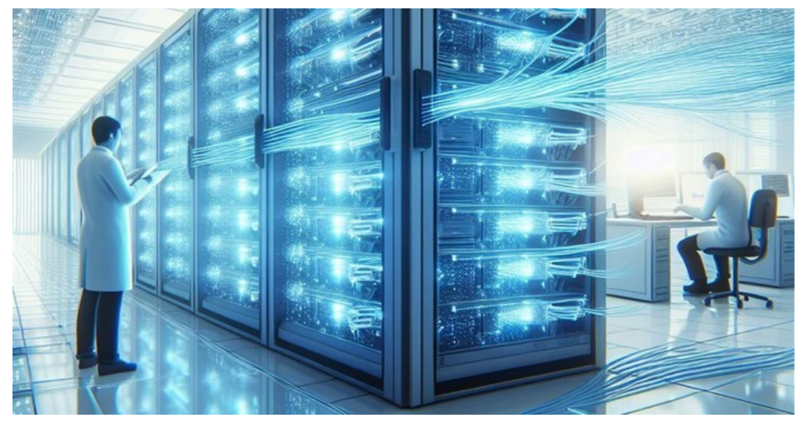
Dell is bringing AI closer to enterprise customers with Nvidia partnership

Dell Technologies is deepening its partnership with Nvidia in an effort to make it easier for businesses to harness the power of artificial intelligence (AI). The company announced the expansion of its Dell Generative AI Solutions range, including the launch of the Dell AI Factory with Nvidia. This move aims to help companies collect and process their own data, streamlining the development of powerful AI tools.