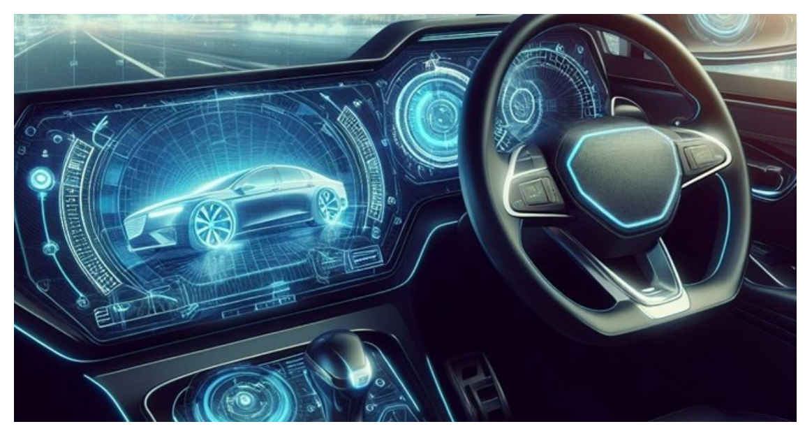
Audio is predicted to be the great differentiator in future mobility.

South Africa's growing electric vehicle (EV) market, projected to grow by 16.3% year-on-year through 2028 and <u>reach R615m by 2024</u>, offers a glimpse into a future powered by innovation. However, for the automotive industry, electric charging is just the beginning. By 2030, an estimated <u>95% of new vehicles sold globally will be connected</u>, meaning software, personalisation, and automation will take centre stage, defining the next era of automobiles.