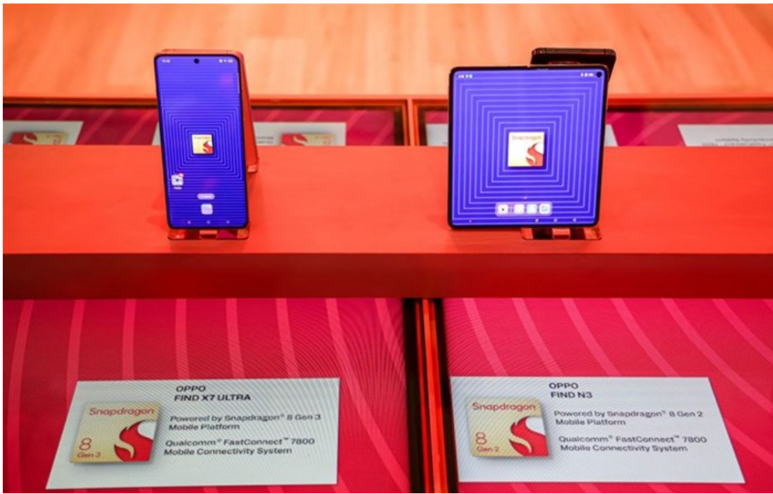
Oppo Find X7 Ultra and Oppo Find N3 at Qualcomm booth

Meanwhile, a series of Oppo innovative products, including the Oppo Find X7 Ultra and the Find N3 series, is also being showcased at Google's Android Partner Walk, demonstrating the comprehensive cooperation between Oppo and Google in creating smarter user experiences over the years.